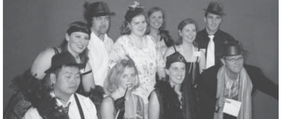
Tomorrow's leaders. Wisconsin participants enjoyed the gangster theme party as part of the 2003 New Practitioner Leadership Conference.

When I was asked to write an article about the New Practitioner Leadership Conference, I brainstormed by sifting through archived issues of JPSW , searching for any article I could find that related to leadership. I stumbled upon photographs of past participants of the Conference, and as I studied the faces and skimmed the names, one thing became clear: I recognized many of the faces. Whether I recognized them from their active participation in PSW or national pharmacy organizations, from a speech they gave at a state or national meeting, from a clerkship site where we had practice together, or because they had been my instructor at Rennebohm Hall, one thing was clear in my mind, these pharmacists had contributed greatly to the exceptional mix of leaders in the profession of pharmacy.