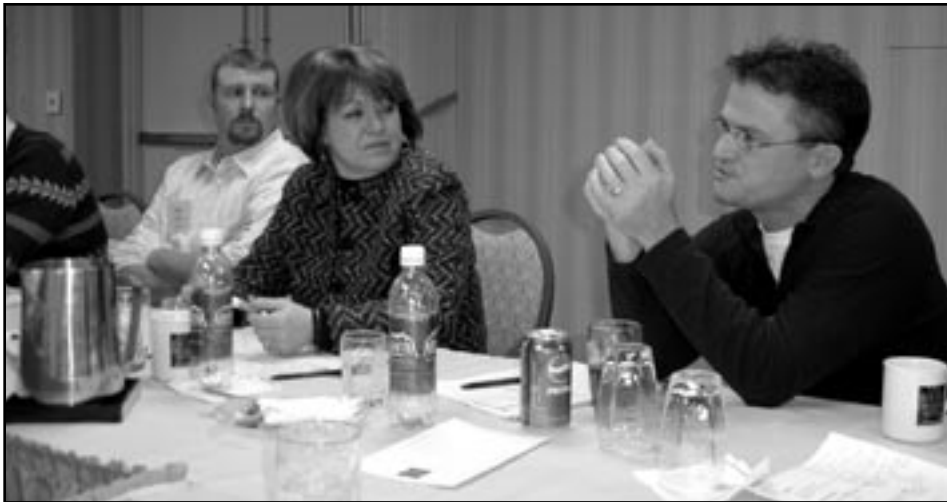
The assembled LTC leadership recognized the need to broaden the services that the Section provides to its members considering current marketplace trends.

The retreat concluded with a discussion on the role of long term care pharmacists in today's health care system. The group recognized that there is still a need to provide educational, professional, and legislative